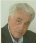
By Seymour Seidman Seidman